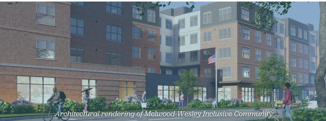
Architectural rendering of Melwood-Wesley Inclusive Community

Wesley Housing announced its plan to merge with Virginia United Methodist Housing Development Corporation (VUMHDC) , a 501(c)(4) non-profit corporation that owns and operates affordable housing units for older adults and families across Virginia. With this expansion, Wesley Housing is positioned to serve over 4,700 residents across 42 communities (more than 3,000 units).